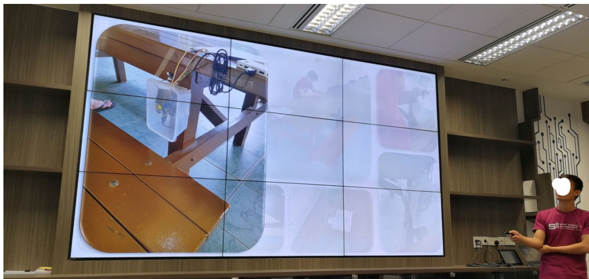
Figure 3. A student explains his group's prototype design to the rest of the class.

The open and adaptive nature of the course gave students a greater sense of ownership towards their work, particularly since they had the opportunity to conceptualise and do iterations of their collaboratively designed projects. This was reflected in the different application of projects, the roles and responsibilities assigned to group members in the project, and the different tools and resources they used. For example, the choice of projects and resources used were often related to students' personal experiences or issues close to their hearts, such as concerns regarding food wastage which led to one student deciding to do a food science project; and another deciding to do a sensor-trigger fan ventilation project stemming from their interest in energy conservation. Other examples include students showing initiative when it came to taking various roles and responsibilities in their projects, from gathering resources, leading or mediating discussions, identifying problems, gathering the technical requirements, coding, preparing for and leading the presentations.