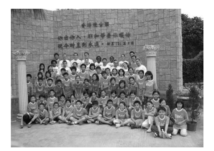
Figure 1. 2006 Camp Adventure TM Youth Service Program in Hong Kong