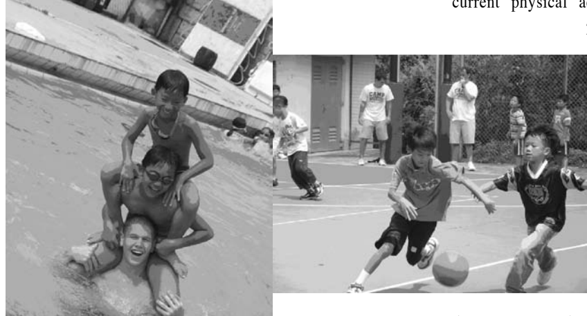
Figure 4. Clubs and Swimming.

The lack of access to physical activities has drawn concerns related to increasing levels of childhood obesity (Henderson & Ainsworh, 2001). Decreasing levels of physical activity during leisure have been cited as a factor leading to increasing obesity; in fact, today's children and youth are considered the most inactive generation ever (American Obesity Association (AOA), 2000). As adult leisure participation patterns tend to be set during childhood (Mannell & Kleiber, 1997), this increasing physical inactivity may set the trend a continued trend throughout the life course. In Hong Kong, recent data has shown that the prevalence of overweight and obesity in children (aged 6-13 years)