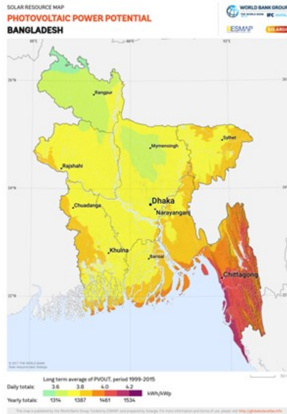
Figure 2: Photovoltaic Electricity Potential for Bangladesh [8]