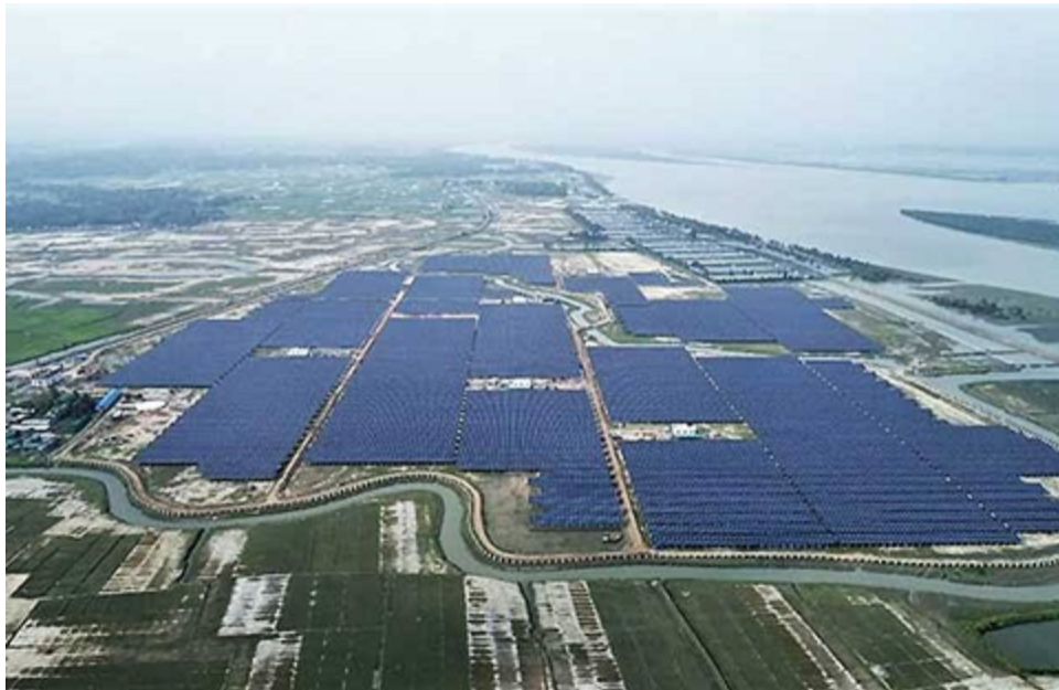
Figure 3: Bangladesh's first larger PV power plant in Teknaf

The plant has five sub-stations each surrounded by panels. The power generated by these panels is primarily stored at the facility, and is then later transmitted to the substation of Palli Bidyut, located in the Leda area of the Hinla union. The solar PV plant will cover up to 80 percent of the present electricity demand of the entire Teknaf region, resulting in a reduction in CO 2 emissions of 20,000 tons per year, with an estimated 400,000 tons of carbon dioxide emissions expected to be prevented over the next 20 years. Table 1 summarizes the 28 MW power station's specifications.